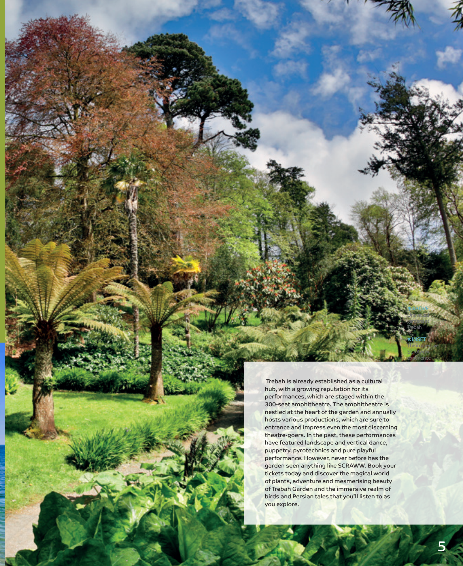
ABOVE Unrivalled gardens at Trebah INSET The immersive SCRAWW experience